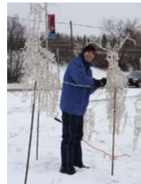
LWDHF Board at work on the Greenbelt for Tree of Life 2010