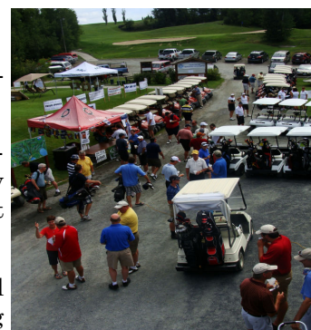
Golfers prepare to hit the course