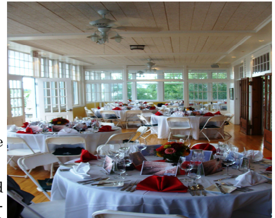
Royal Lake of the Woods Yacht Club