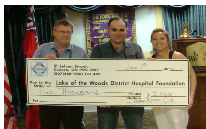
Presentation made at weekly Rotary Luncheon

June 2010 saw Kenora Rotary Club reach a mile stone with their $5,000 donation to LWDHF. This donation put them over $132,000 in financial support!