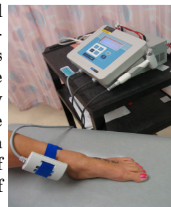
New Hands-free Ultra Sound

A patient suffered a broken ankle in November 2009. She went through months of rehabilitation at LWDH including Ultra Sound Therapy to help the bone heal. In July 2010, she read about some of our hospital’s needs for this year and one of the items listed was a new Ultra Sound Machine for the Rehabilitation Department. The staff took such good care of her during her treatment, that she and her husband called LWDHF to make a donation of $3,400 to purchase the new machine.