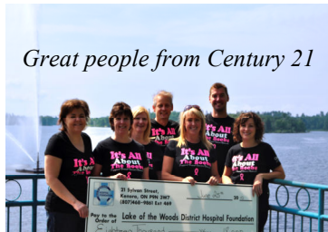
Great people from Century 21

The great staff at Century 21 Reynard Real Estate Kenora took up the cause and hosted Boobie Nights June 5, 2010. The event raised $18,000 to go towards mammography and chemotherapy departments.