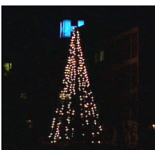
The Tree of Life lights up the sky for all to celebrate.

With the coming of winter, warm thoughts arise in the community as loved ones are remembered and friends are honored. The Tree of Life provides a wonderful way to rejoice in the true spirit of the Christmas season. Each dedicated bulb helps to address the ongoing financial pressures faced by the hospital.