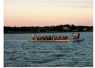
The passion of hospital staff was demonstrated on Rabbit Lake.