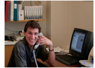
Foundation staff look forward to discussing your interests. Philanthropy does not have boundaries.